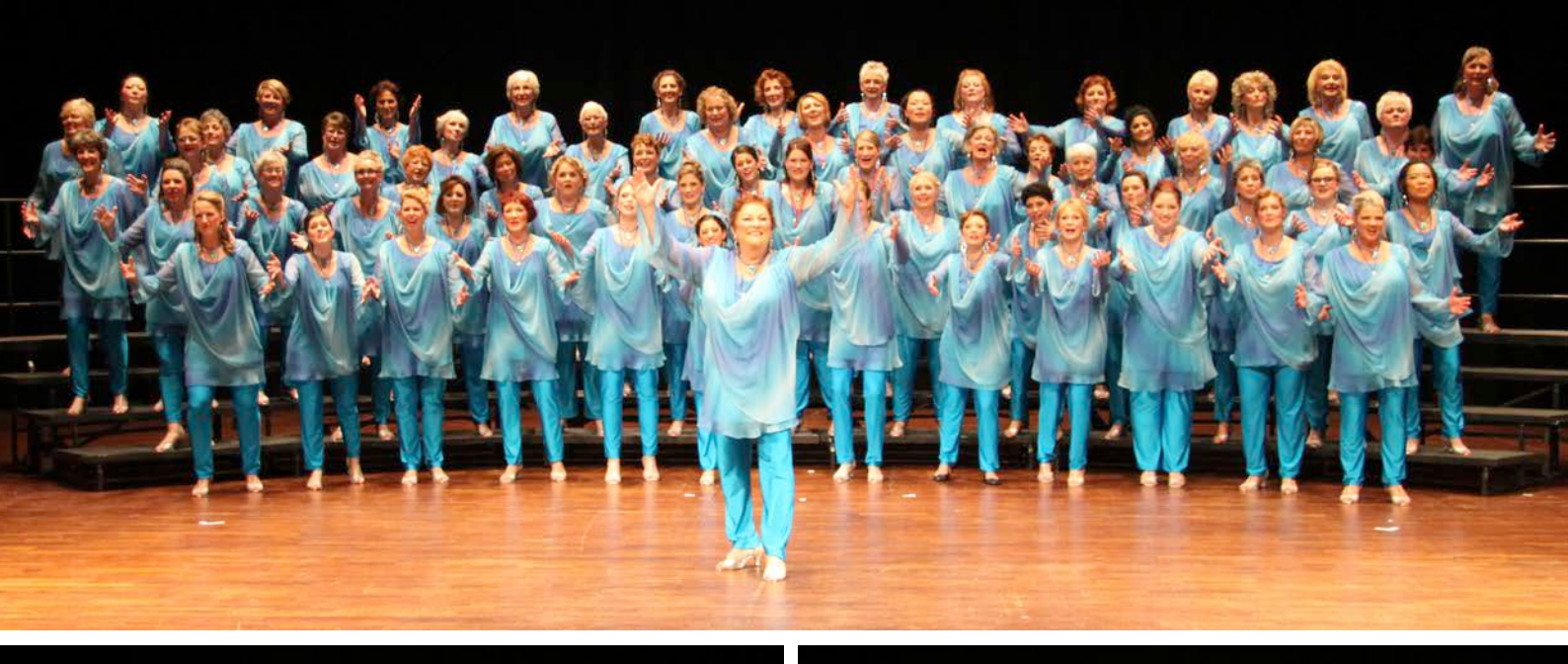
Waikato Rivertones - 2nd place overall