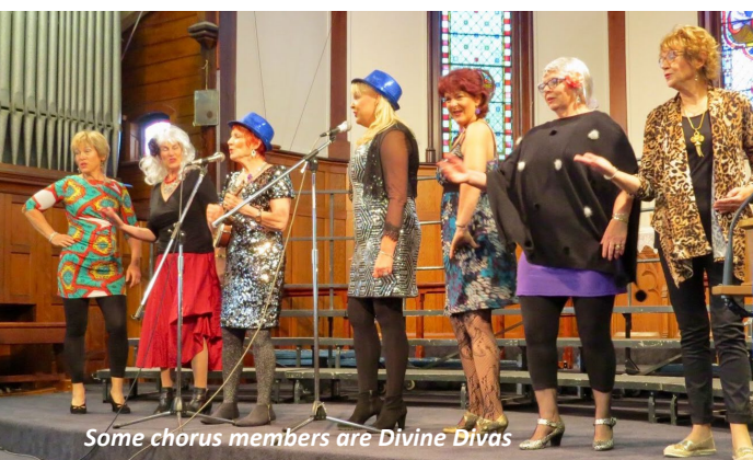
Some chorus members are Divine Divas