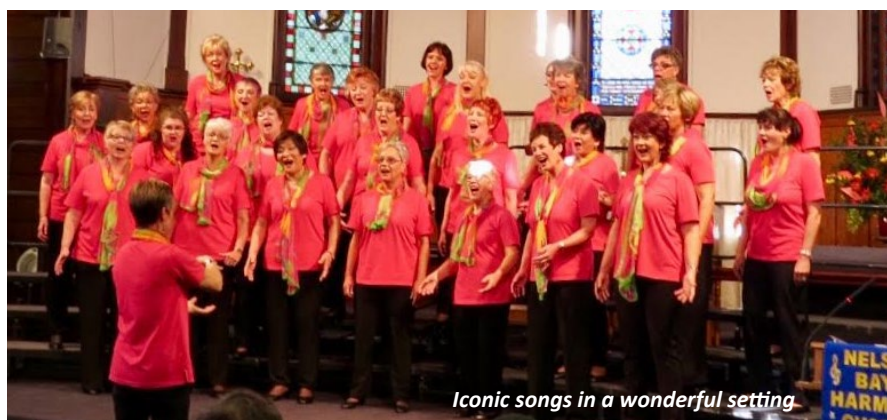
Iconic songs in a wonderful setting