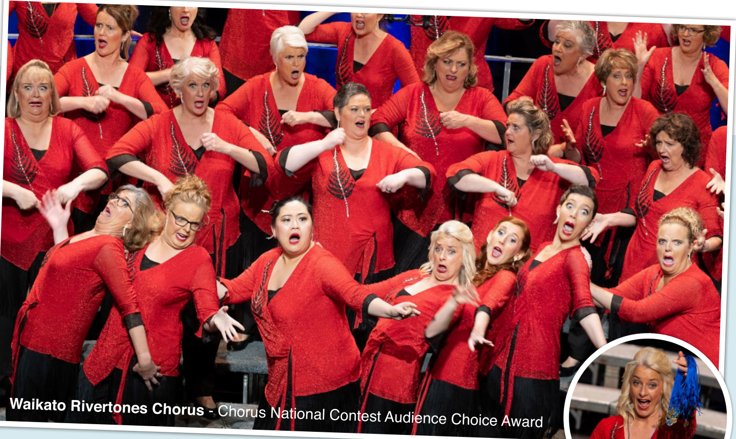
Waikato Rivertones Chorus - Chorus National Contest Audience Choice Award