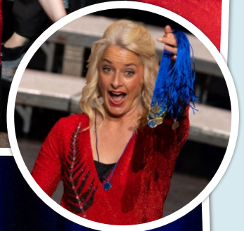
Nelson Bays Harmony Chorus - Chorus Open Contest Audience Choice Award