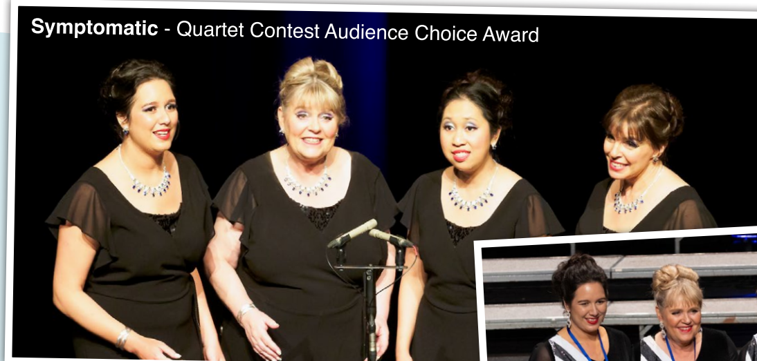
Symptomatic - Quartet Contest Audience Choice Award