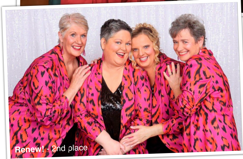
Renew! - 2nd place