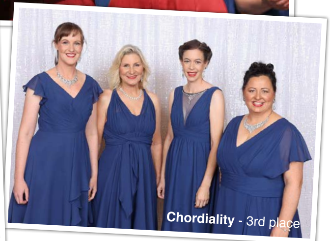
Chordiality - 3rd place