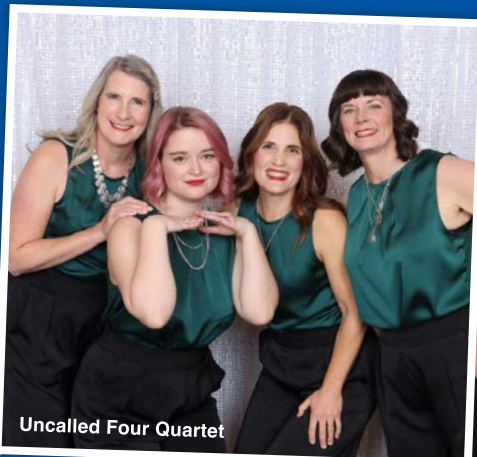
Uncalled Four Quartet