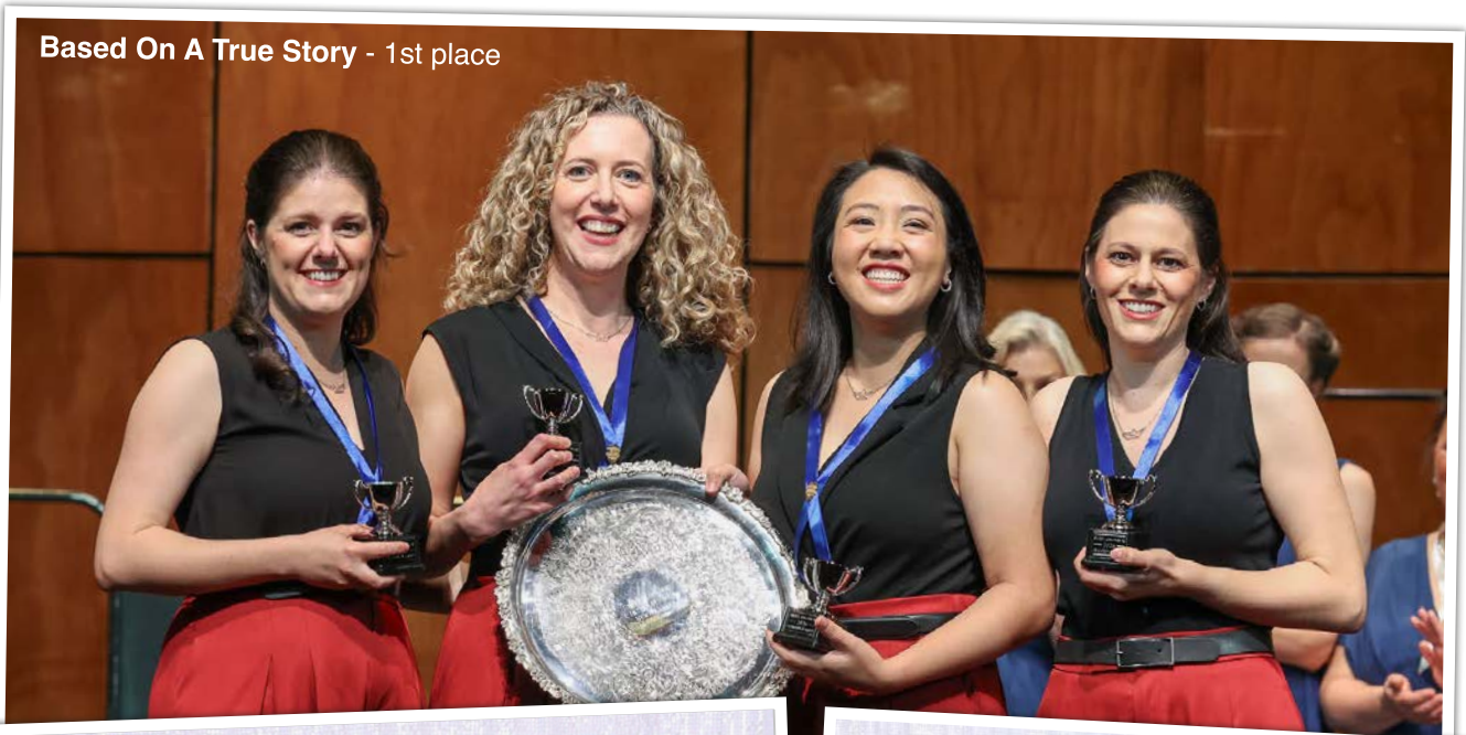
Based On A True Story - 1st place