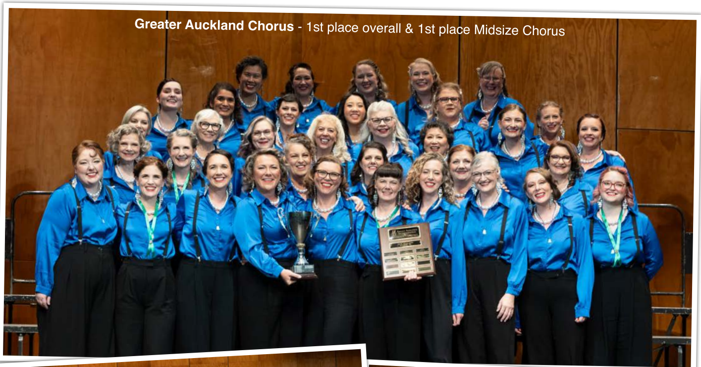
Greater Auckland Chorus - 1st place overall & 1st place Midsize Chorus