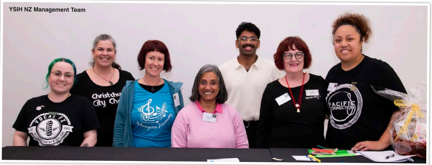
YSIH NZ Management Team