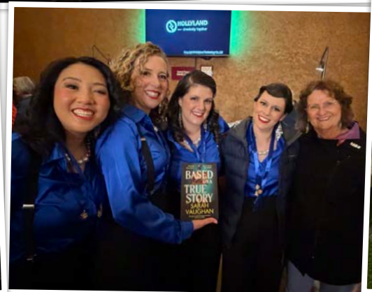
Arrangers at the Afterglow