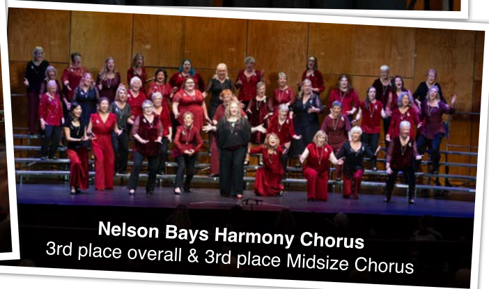
Nelson Bays Harmony Chorus 3rd place overall & 3rd place Midsize Chorus