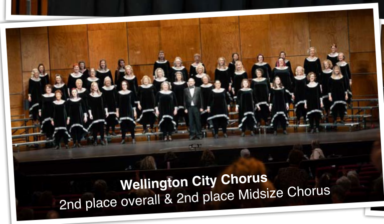
Wellington City Chorus 2nd place overall & 2nd place Midsize Chorus