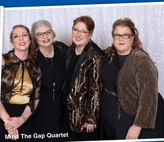
Mind The Gap Quartet

What's been so cool is seeing people back themselves, try new voice parts, and give quartet singing a go!