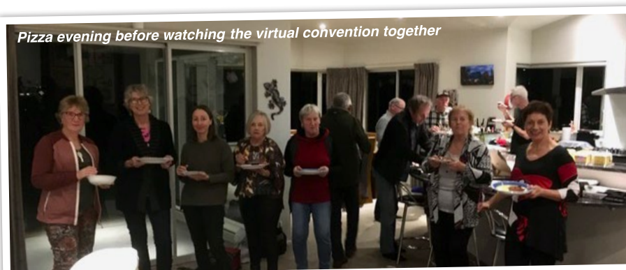
Pizza evening before watching the virtual convention together

Director wanted for Whangarei Harmony Chorus. View our advert on the previous page.