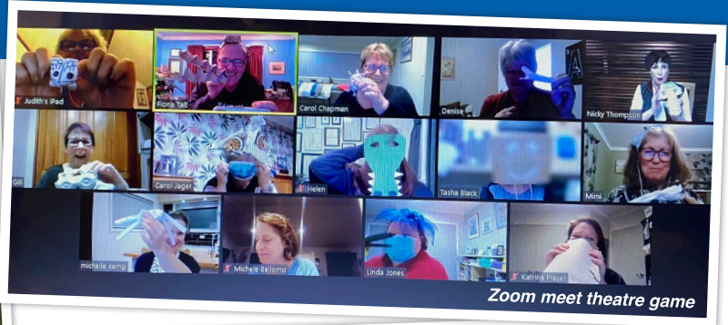
Zoom meet theatre game