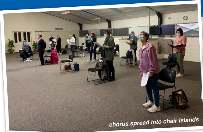
chorus spread into chair islands