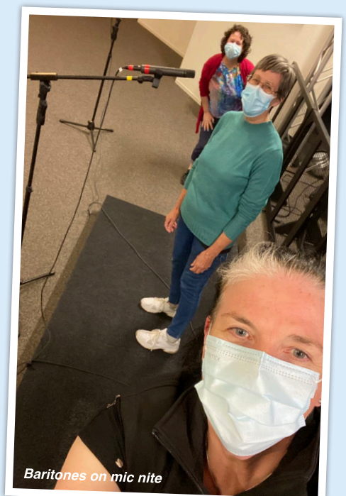
Baritone on mic nite