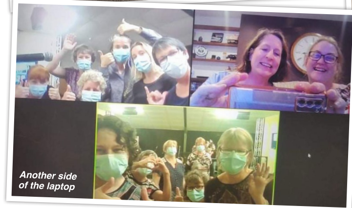
Another side of the laptop