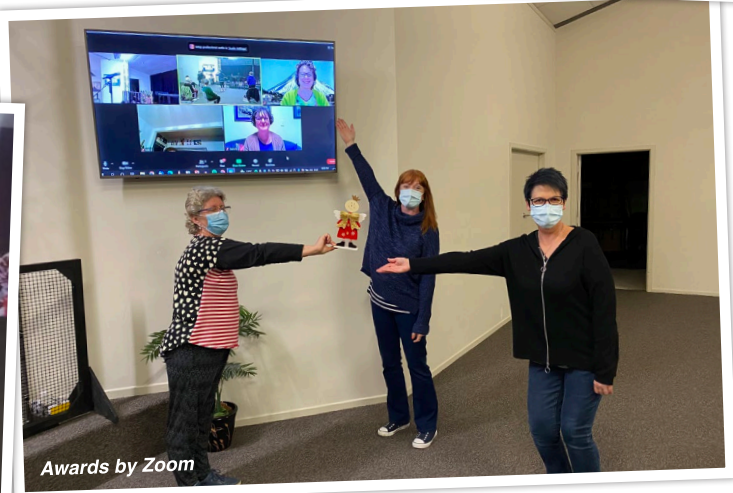
Awards by Zoom

Our choice of songs was easy as we had no 'new to virtual stage' members – we knew these songs and liked the sound of our chorus performing them. We pulled together all our past coaching information and teachings, revisited the videos held online, and reworked a previous package with renewed effort.