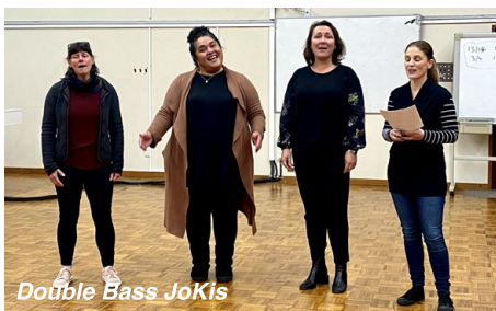
Double Bass JoKis