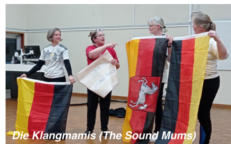
Die Klangmamis (The Sound Mums)