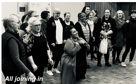
All joining in