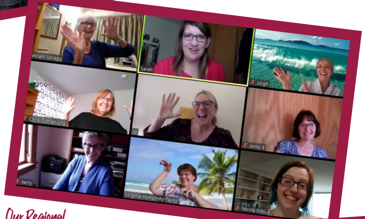
Our Regional Management Team keeping connected by Zoom June 2020