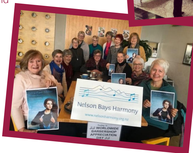
Members of Nelson Bays Harmony celebrating Worldwide Barbershop Appreciation Day July 2020