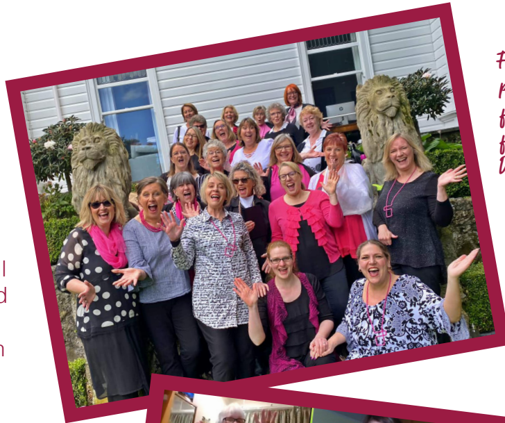
Faultline Chorus performing at a fundraising event for Save the Children December 2020