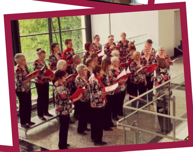
Dunedin Harmony Chorus perform at Otago Museum December 2020